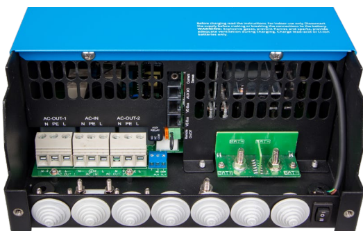
Connection Area MultiPlus-II 3k