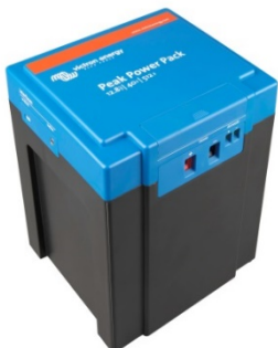
12.8 V, 40Ah