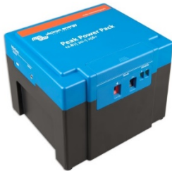
12.8 V, 20Ah