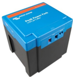
12.8 V, 30Ah